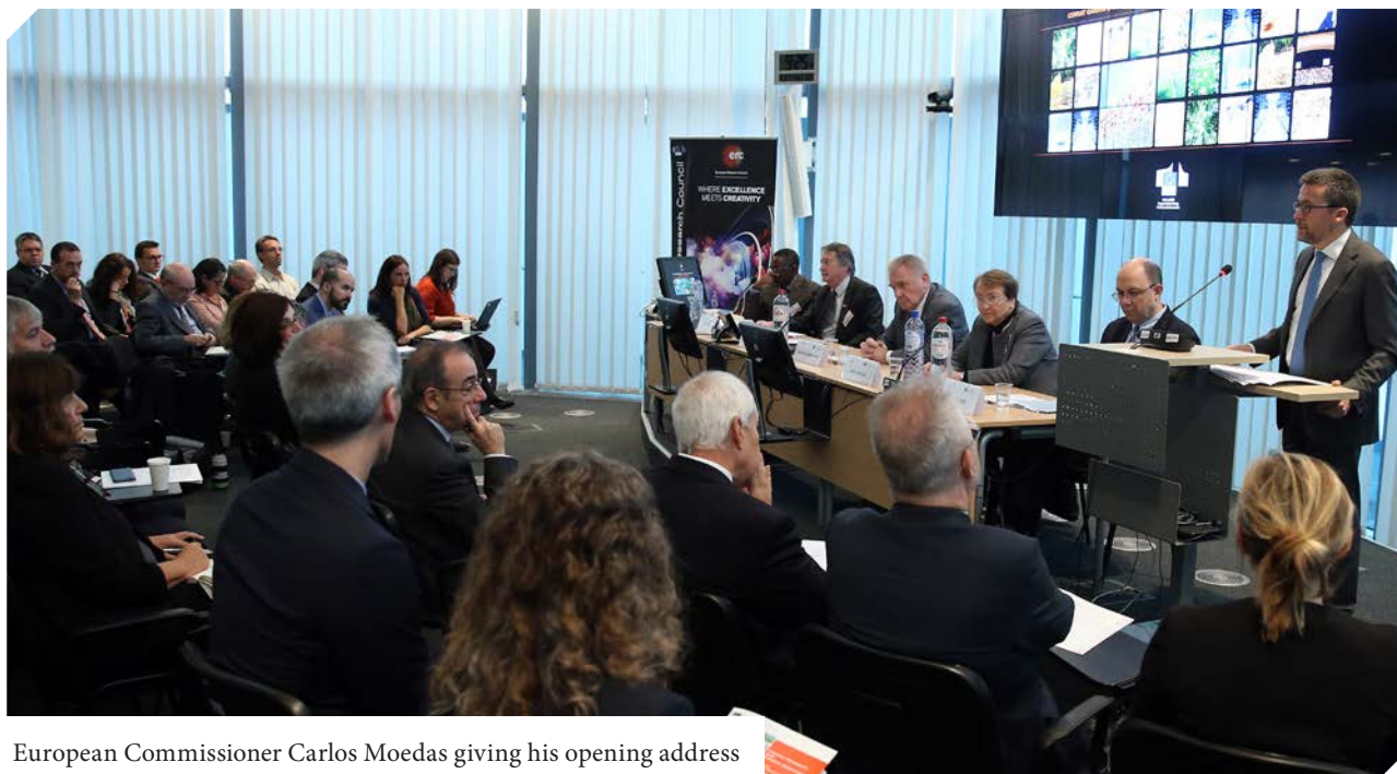
European Commissioner Carlos Moedas giving his opening address

development. The last remarked that science can make an invaluable diplomatic contribution by bringing hard data to the negotiation table to make it possible for countries to agree on climate change targets.