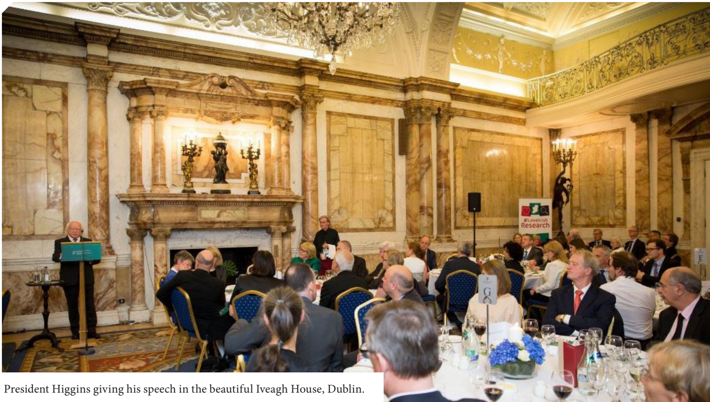
President Higgins giving his speech in the beautiful Iveagh House, Dublin.